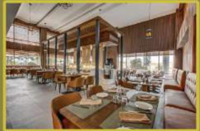
LULLA NAGAR, PUNE