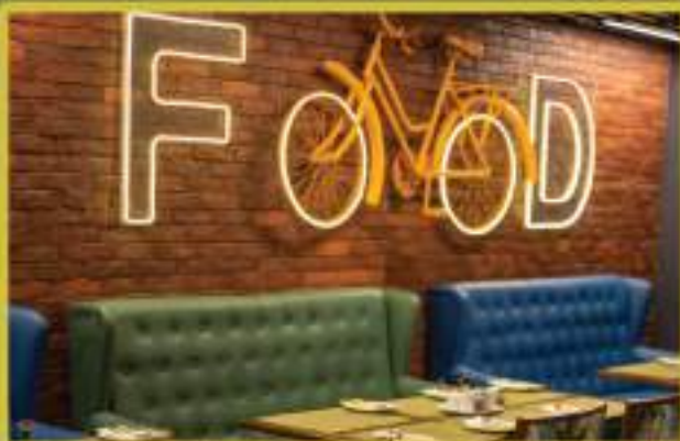
C SCHEME, JAIPUR