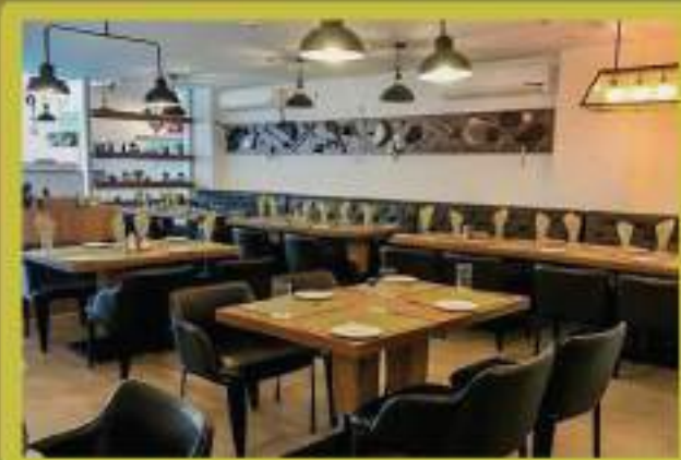
AL KARAMA, DUBAI