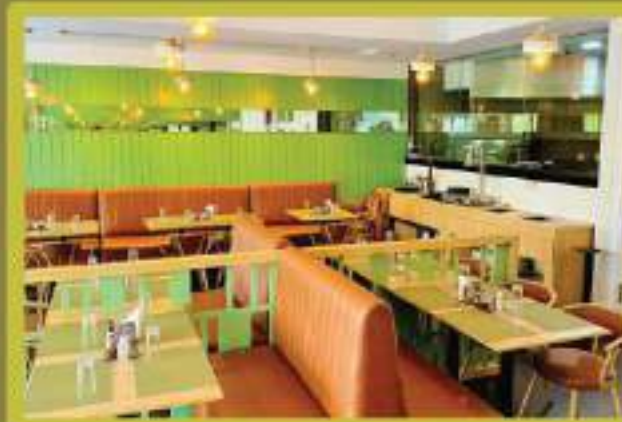
BUSINESS BAY, DUBAI