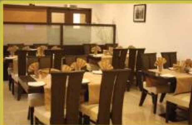
BESANT NAGAR, CHENNAI