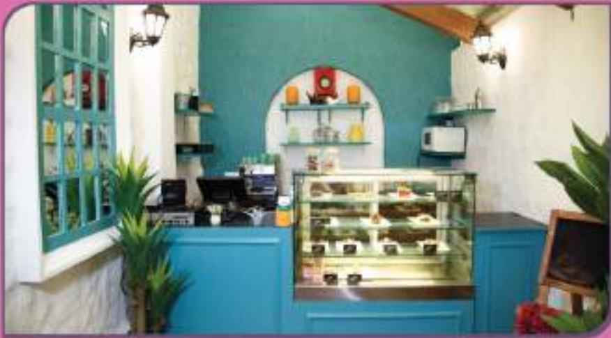
BUND GARDEN, PUNE