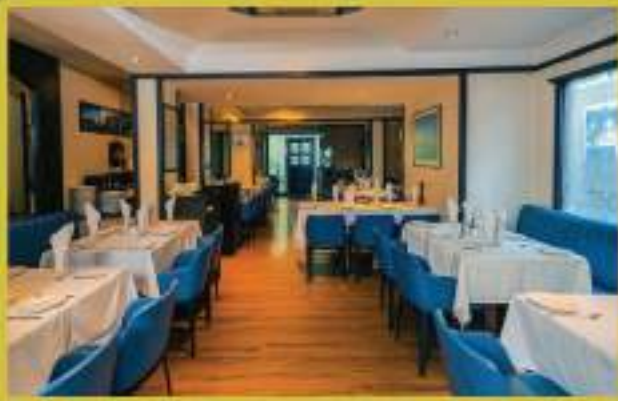
BUND GARDEN, PUNE